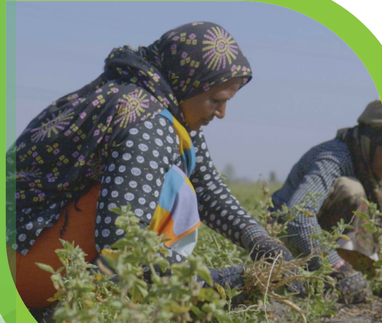
ashwagandha ( withania somnifera ) harvest, india