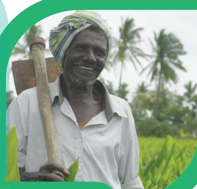
turmeric ( curcuma longa ) farmer, india