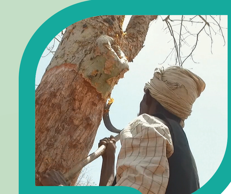
boswellia ( boswellia serrata ) collection, india