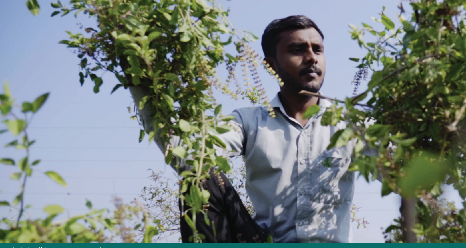
holy basil ( ocimum sanctum ) farmer, india

working with key stakeholders and customers to ensure mutually aligned efforts in promoting sustainable practices and policies