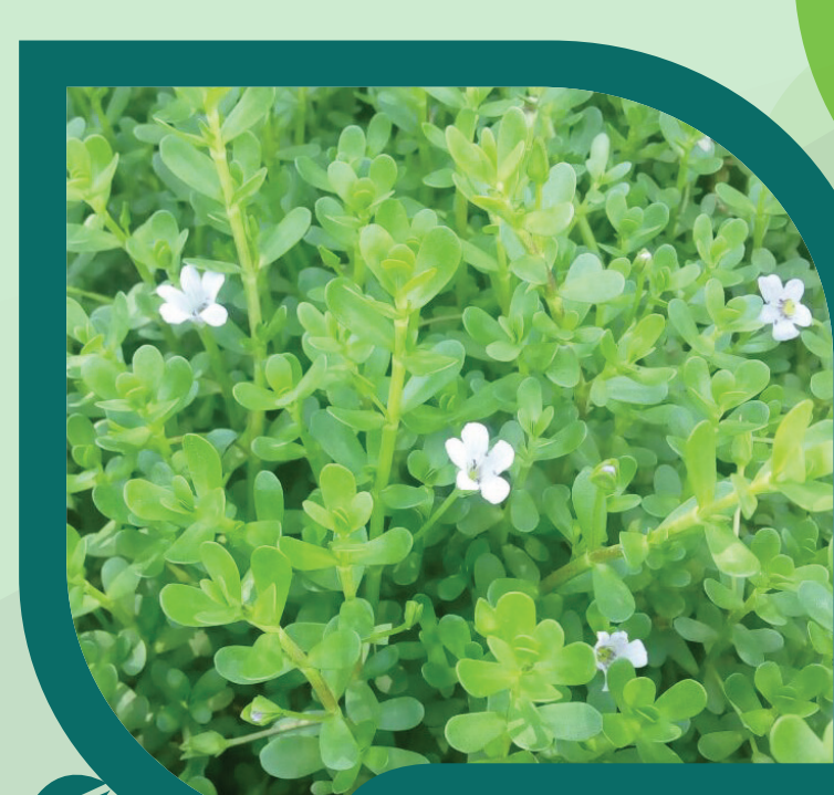
bacopa ( bacopa monnieri ), india